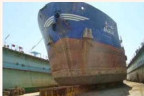
【Repair of dredger】