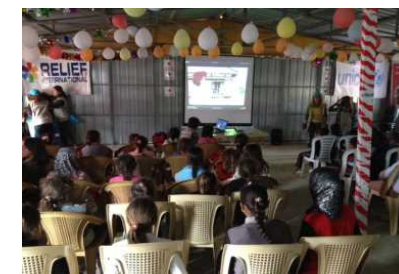
【Japanese Animation film event in IDP camp】