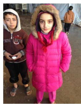
【IDPs in donated clothes】