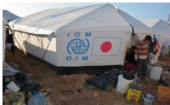
【Tent for IDPs】

Provision of shelter, food, water, medicine, ambulances Rehabilitation of schools, hospitals, Legal assistance, Preservation of cultural heritages, human rights