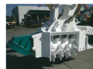
【Attachment to remove mines buried in unlevel lands】