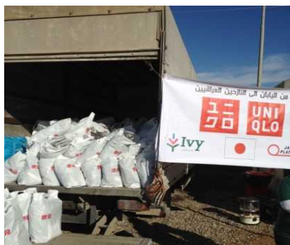
【Distribution of clothes】