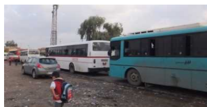
【Buses to a school for Syrian refugees funded by Japanese NGO】