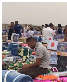
【Distribution of daily necessities】