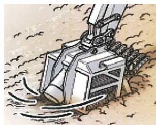
An attachment to separate dirt from the iron scraps after exploding mines/UXO