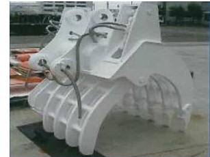
An attachment to dig up mines without being exploded