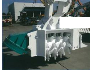
An attachment to remove mines buried in unlevel lands (mountain range, water ways)