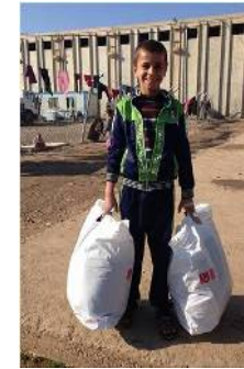
【IDPs with packets of clothes】