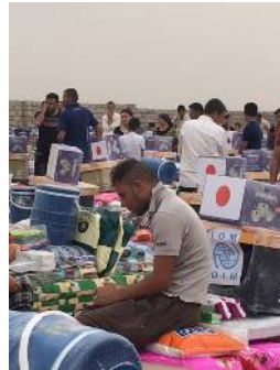
【Distribution of daily necessities】