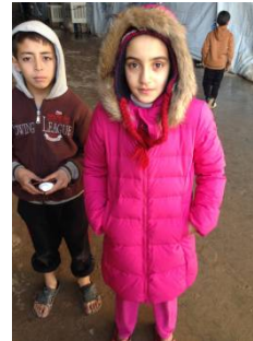
【IDPs in donated clothes】