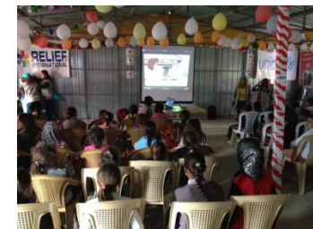
【Japanese Animation film event in IDP camp】