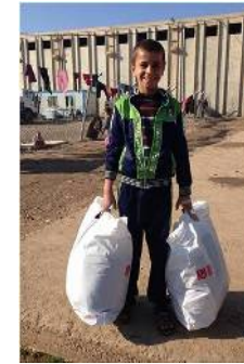
【IDPs with packets of clothes】