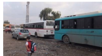
【Buses to a school for Syrian refugees funded by Japanese NGO】