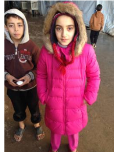
【IDPs in donated clothes】