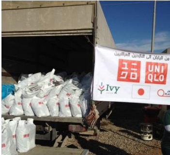
【Distribution of clothes】