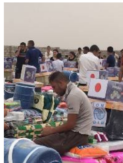
【Distribution of daily necessities】