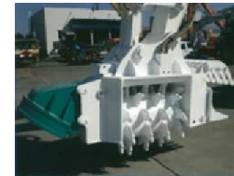
【Attachment to remove mines buried in unlevel lands】