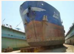
【Repair of dredger】