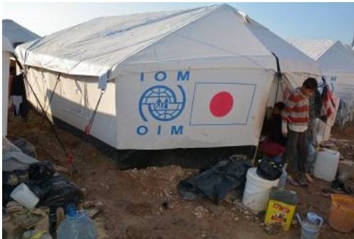
【Tent for IDPs】

Shelter, Food, Water, Medicine, Ambulances, Blanket, Schools, Legal Assistance, Human rights Preservation of Cultural heritages